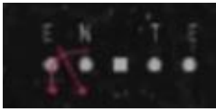
Left Exit 2 Man