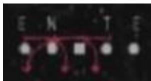
Left Pirate 3 Man